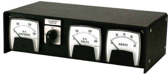
P1 & P3

7" (w) x 7" (h) x 7" (d) (2.70" panelboard style meters)